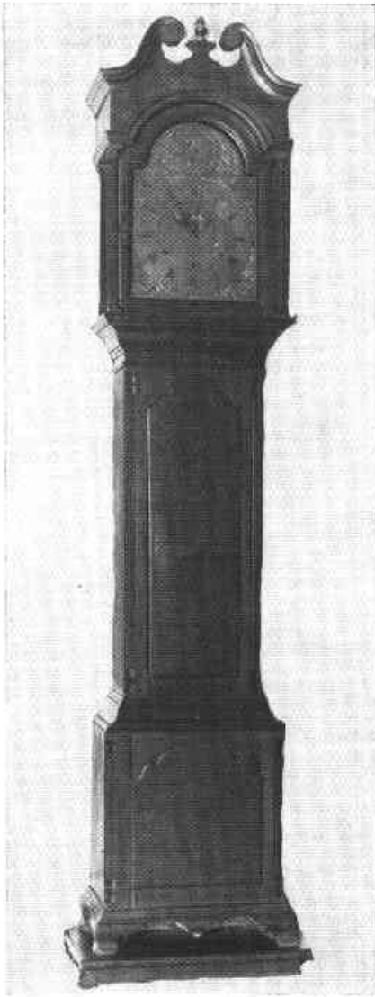
PH 1 Rittenhouse Tall Clock

When the clock was put in order by Mr. Gropengiesser he introduced a new musical barrel, playing six different airs, vis. Old Folks At Home , Home Sweet Home , Auld Lang Syne , Star Spangled Banner , The Last Rose of Summer , and Then You'll Remember Me . There is no record telling what airs were formerly played by this instrument. The clock was originally made with a Cirhell (circular) or Graham escapement, which has no maintaining power, such as now is commonly used in these clocks. It also has a peculiar system of calculating fractional numbers, which early in the present century was abandoned by clock-makers, for a better mode of dividing equal numbers by higher number of cogs in the calculation. The clock has a wooden pendulum, beating seconds. The dial is of metal, engraved, the numbers being in Roman characters. The upper central portion above the dial exhibits the planetarium, on the left hand upper corner of the dial is a small dial giving the tonic position of the moon, the right upper corner shows the sun equation, by a hand indicating the daily differences between the mean and the apparent time. In the left lower corner is an arrangement to control the mechanism for striking; on the right side is a dial indicating the succession of six times. On the inner hour circle of the dial is the moon with a special visage of the position of the same. It also shows the movement of the earth independently of the moon.