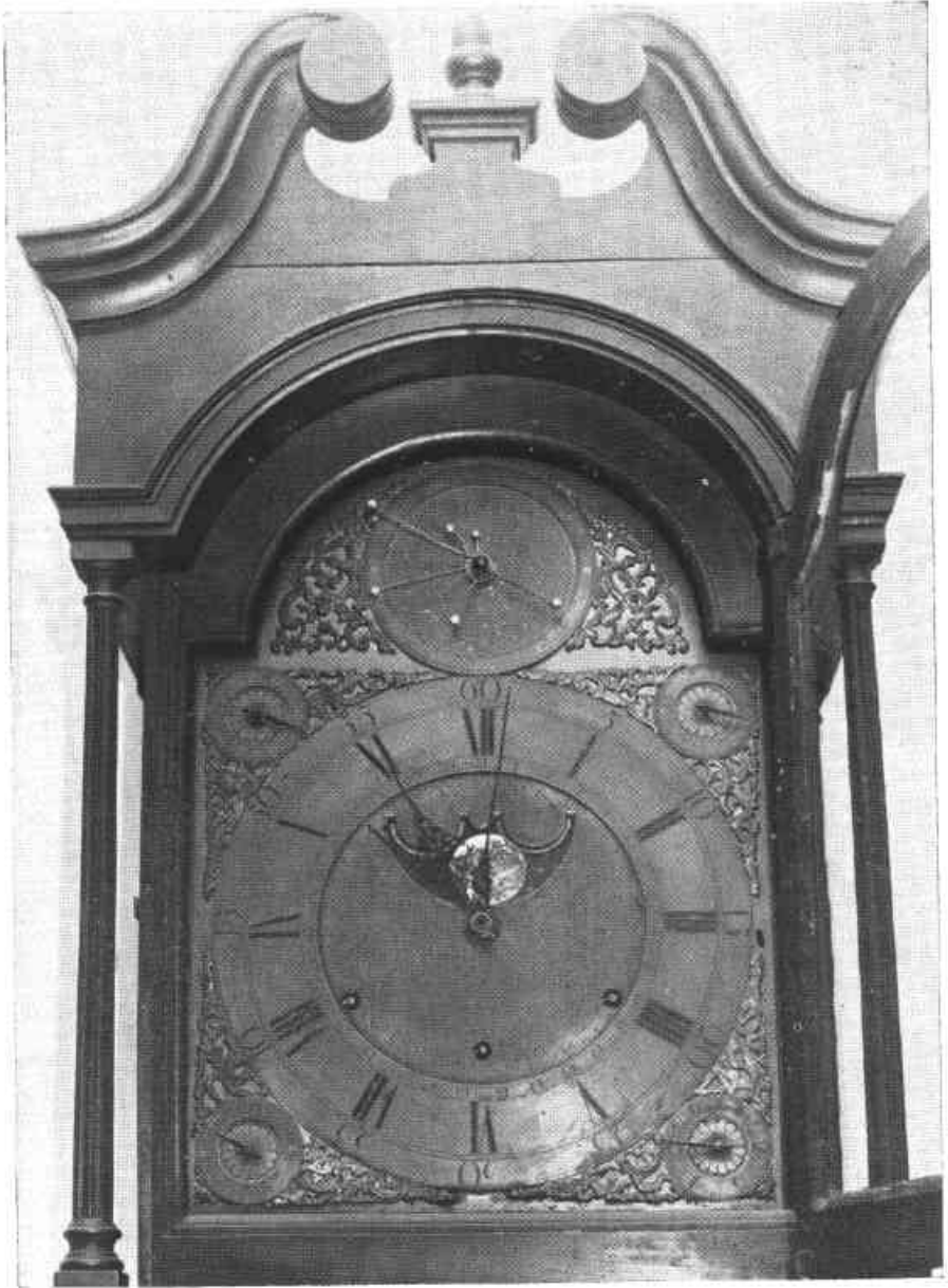
PH 3 Dial of the Rittenhouse Clock

tween Walnut and Chestnut), for a block east and half a block west, you will find watch emporiums galore. Return to Walnut and take a bus to Seventeenth, get off and walk north three blocks to Convention headquarters. (To be continued)